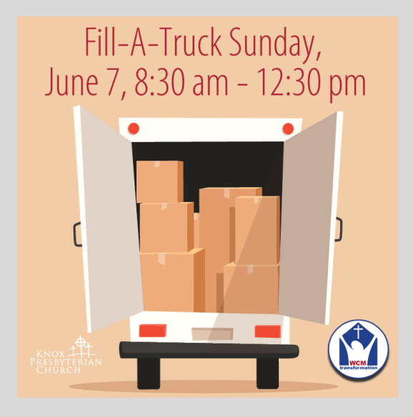
Drive & Drop - Fill A Truck Sunday! Put your items in your trunk, drive to Knox and drop them off without leaving your car.

Donate online - on Knox website and select fund Hesed House